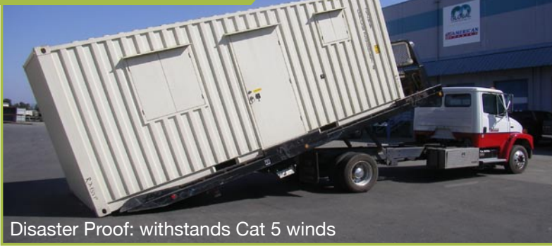
Disaster Proof: withstands Cat 5 winds

The Ultimate, with its modern finished kitchen, bathroom and extra room (8' x 40' model), is our most complete portable building, ideal for an office, temporary housing, or many other uses. Standard features include kitchen, bathroom (with shower, toilet, sink), bedroom/office (8' x 40' model), AC electrical system, telephone/internet connection, 2" rigid insulated finished walls and ceiling, windows, entrance door, finished linoleum/vinyl floor and utility room. Like all our portable buildings, the Ultimate provides great resistance to natural disasters.