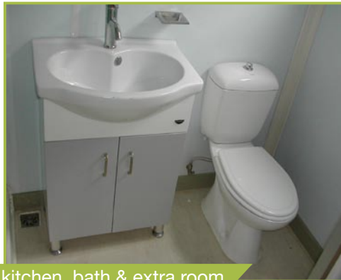
Ultimate, complete with kitchen, bath & extra room